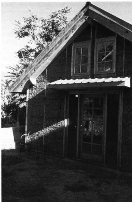
This small house in Kingston, New Mexico, is a timber-frame structure with light-clay infill, a traditional European technique in which straw is coated with a clay slip and then compacted into forms to make the walls. The building is shown ready to be plastered.

The alternatives described in the articles that follow represent only some of the many ancient and modern alternatives that are emerging as important components of the solution to building a sustainable future. Among the others not mentioned are methods related to adobe and rammed earth, such as cob and puddled adobe, which use a wet mix of straw, clay and sand to hand-build walls. There are tens of thousands of cob cottages still in use today that are hundreds of years old in the United Kingdom and elsewhere. Another method is leichtlehm , or light-clay construction, where straw is coated with a clay slip and compacted into forms as an infill material within structural framing. This technique has a successful history in places like Germany, also dating back hundreds of years. There are many variations on these materials and techniques, such as wattle and daub, which are widely recognized in Europe as traditional ways of building. Other materials, such as thatch for roofs, reed mats as lath for plaster, bamboo as a structural material, and earth for plasters and floors, are all gaining in popularity and have legitimate and important roles to play in building for the future.