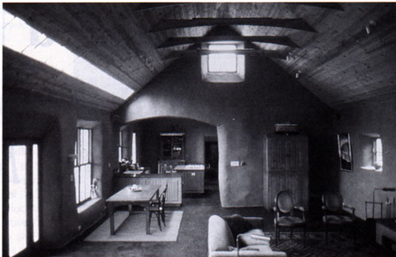
The interior of this straw-bale house in Santa Fe, New Mexico, features earthen floors with hydronic radiant heating and earthen plaster finishes on all the interior walls. This 3,800 square foot house (353 m 2 ) recently resold for nearly three quarters of a million dollars.

We all recognize the need to address the potential for harm from building failures, both in the near term and those that might happen long after the builder or original owner is gone from the scene. This is certainly a legitimate concern. Yet if we believe we have a responsibility for the welfare of both current and future residents of the buildings we are dealing with today, we also must face the task of balancing their future wel-