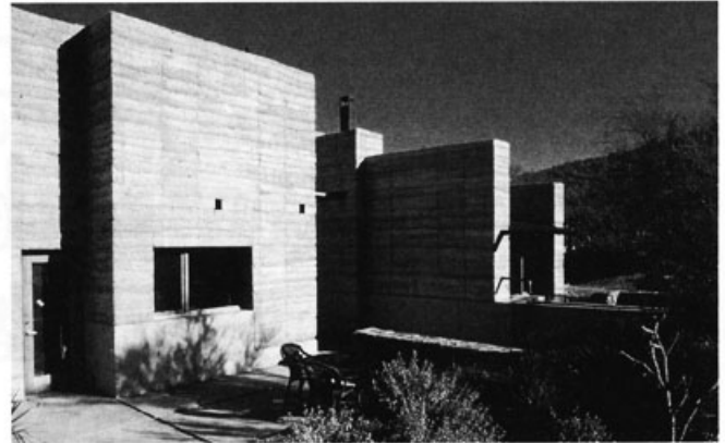
Exposed cement-stabilized rammed earth form the 24-inch-thick (610 mm) walls of this house in Tucson, Arizona.