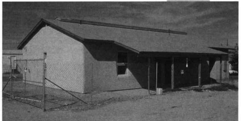
The finished house in Guadalupe, with a typical three-coat stucco finish. It cost less than $50,000 and is a very energy-efficient, 1,120-square-foot (104 m 2 ), three-bedroom dwelling.