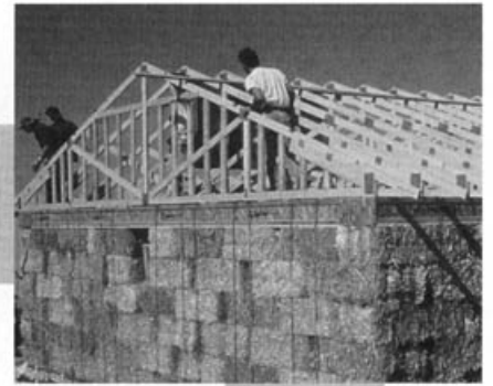
By midafternoon, all the trusses were in place. By the end of the day of the wall raising, the roof was sheathed and ready to be dried in.

to thickness ( t ) ratios, and to the length ( l ) of unsupported walls. California Health and Safety Code Section 18944 limits h/t to 5.6 to 1 [10 feet 8 inches (3251 mm) high for a 23-inch-wide (584 mm) wall], l/t to 15.7 to 1, and top-imposed dead + live loads to 400 psf (19.2 kN/m 2 ). Testing, experience and failures (or the general lack of them) to date suggest that these empirical guidelines are conservative, but not onerously so.