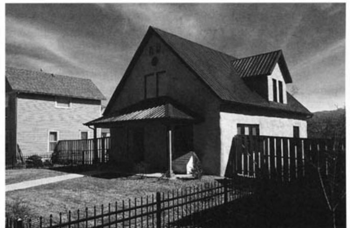
Post-and-beam straw-bale house built in Colorado Springs, Colorado. It is actually two stories in the back, because the lot slopes steeply.

The width of straw bales makes most bale walls inherently sturdy. Recognizing this, codes written to date treat (load-bearing) bale walls like masonry, defining limits to the height ( h )