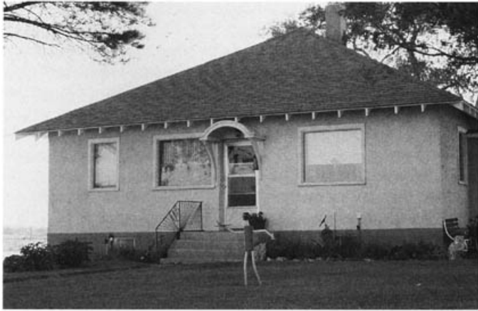
The Scott house was built outside of Gordon, Nebraska, in 1936. It is a classic “Nebraska style,” or load-bearing straw-bale house, in that the bale walls carry the roof and lateral loads.