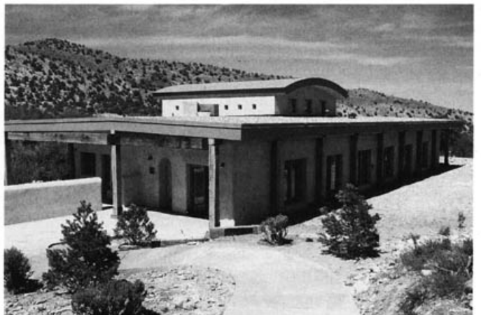
Large post-and-beam straw-bale house outside Moab, Utah. The nearly 100-year-old timbers used in this house were salvaged from a railroad trestle that once crossed the Great Salt Lake.

In thinking of plastered straw-bale walls, it is essential to understand that, once plaster is applied directly to either one or both bale surfaces, the structure is now a hybrid of straw and plaster. Effectively, any further loading—snow, people, wind, earthquakes, etc.—will go mostly or entirely into the plaster