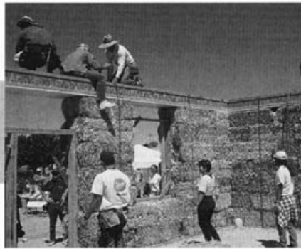
All the bales were stacked and the roof-bearing assemblies were in place and being strapped down by lunch time on the day of the wall-raising for this load-bearing straw-bale house built by the Town of Guadalupe, Arizona.